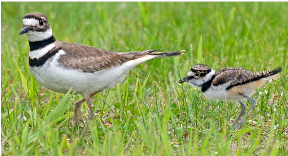
Killdeer with young.

Detailed instructions for all of this, including the different types of breeding evidence codes, more detailed instructions for recording observations and submitting records through eBird are available on our website ( www.maine.gov/birdatlas ) and in the Volunteer Handbook.